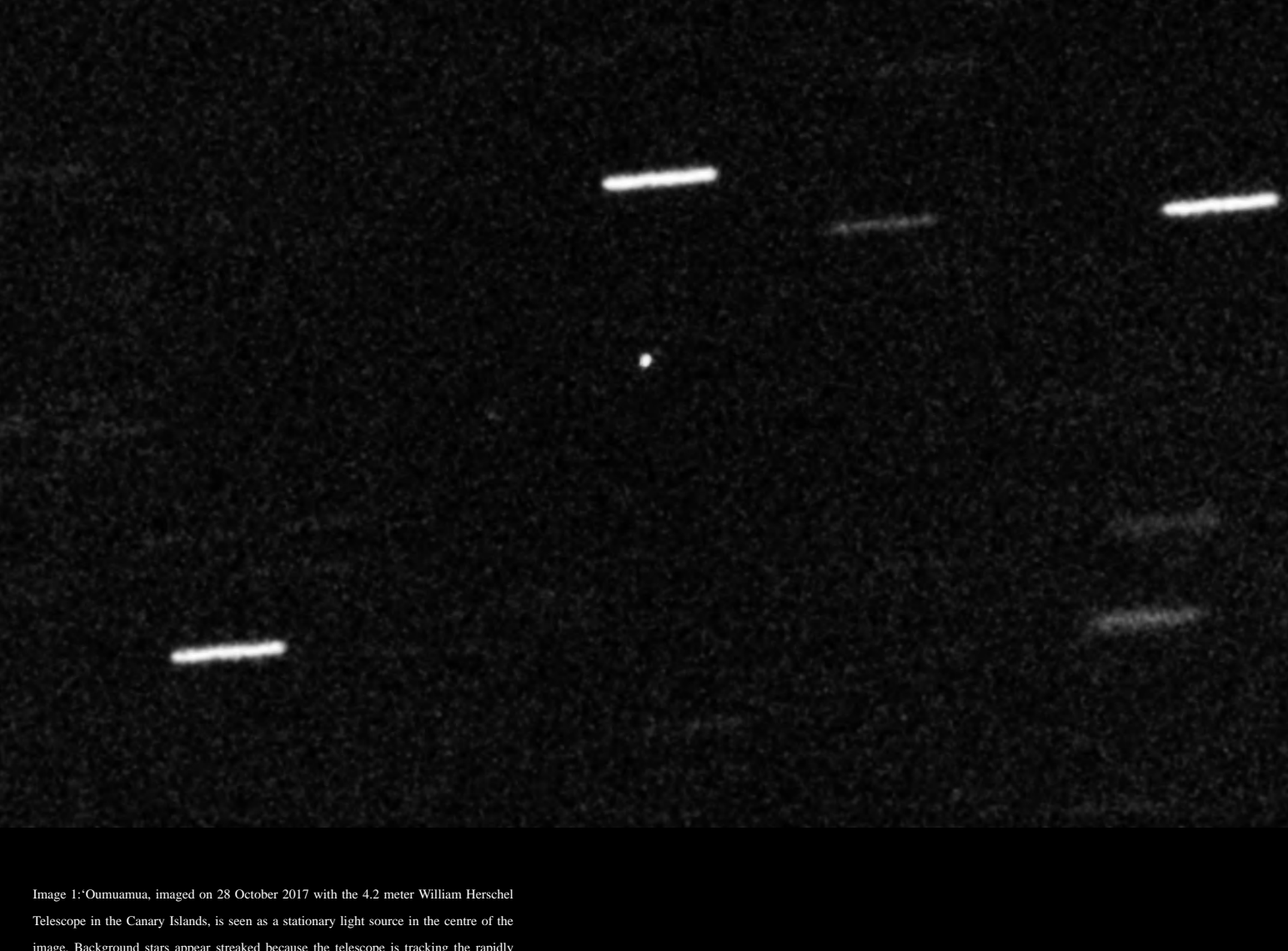
image. Background stars appear streaked because the telescope is tracking the rapidly moving object. Image 2: The Earth and moon viewed by Chang'e 5 from Sun-Earth Lagrange point 1..